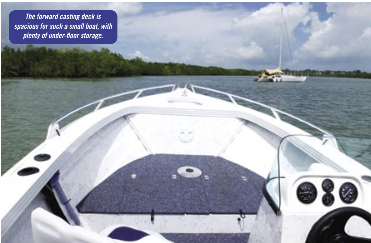
The forward casting deck is spacious for such a small boat, with plenty of under-floor storage.

all-rounder for river, estuary and impoundment fishing. It could also be used for inshore bluewater work.