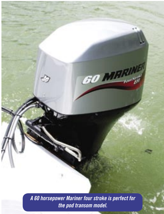
A 60 horsepower Mariner four stroke is perfect for the pod transom model.

The test boat was powered by a 60 horse four stroke EFI Mariner outboard. It was quiet and responsive, and matched the hull well. It planed quickly and easily with three people on board, and at 6000 rpm the Mariner pushed the boat along at an impressive 55 km/h. Dropping the revs back to a more economical 4500 saw the boat travelling at approximately 37 km/h, and it was quite