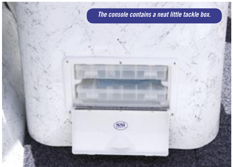
The console contains a neat little tackle box.

There is a live bait tank under the rear casting deck, which comes un-plumbed